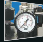
Pressure gauge & regulator