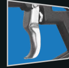
Grip Trigger action