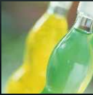
Plastic moulding industry