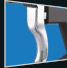
Better grip for effortless trigger action