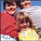
Textile / Fabrics