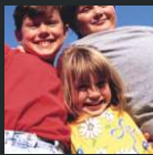
Textile process house