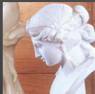
Pottery / Statues