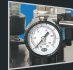
Pressure gauge & regulator