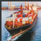
Ship / Building