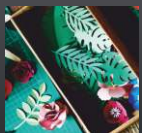
Art & Handicrafts