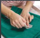
Design & Fashion Studios