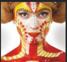
Makeup & Body art