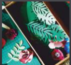
Art & Handicrafts