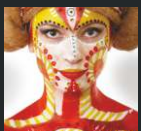
Makeup, Body art