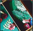
Art & Handicrafts