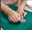
Design & Fashion Studios