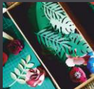
Art & Handicrafts