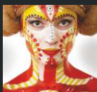
Makeup, Body art