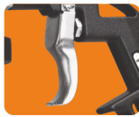
Grip Trigger action