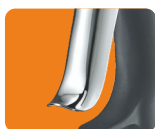
Grip - trigger action