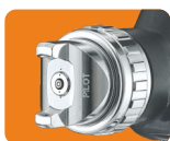
Air cap designed for superior spray atomisation