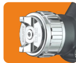
Air cap designed for superior spray atomisation