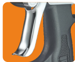
Grip - trigger action