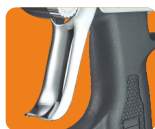
Grip - trigger action