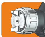
Air cap designed for superior spray atomisation