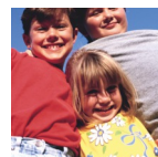
Textile process house