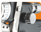
Air & fluid control