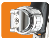
Air cap designed for superior spray atomisation