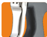
Grip - trigger action