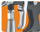
Effortless trigger action