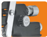
Air & fluid control