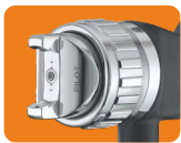
Air cap designed for superior spray atomisation