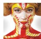
Makeup & body art