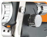
Air & fluid control