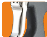
Grip - trigger action