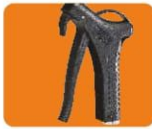
Better grip for effortless trigger action