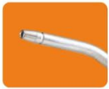
Nozzle for strong air jet